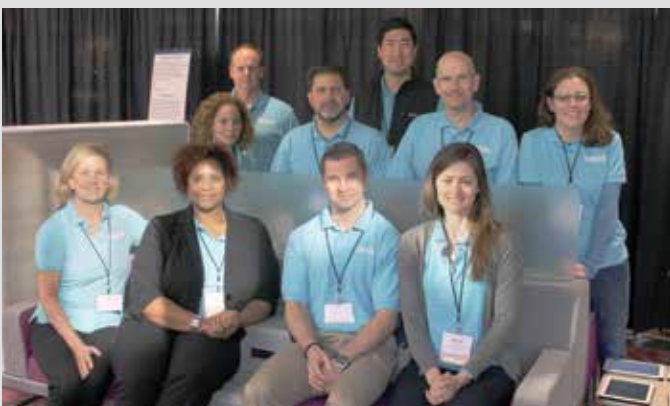
Staff from CIPCI and Asylum Hill Family Medicine led tours of the Primary Care Office of the Future.